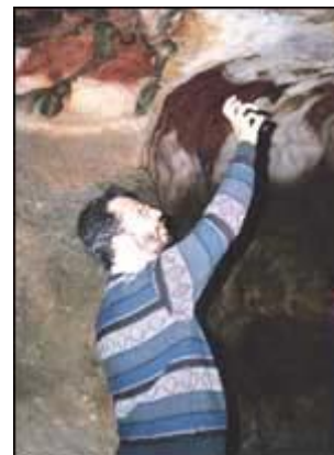
Rappenglueck has found other evidence

Dr Rappenglueck allowed for this effect by using a computer program to wind back the sky and found evidence for a particular star in Orion that was in a different place all those years ago.